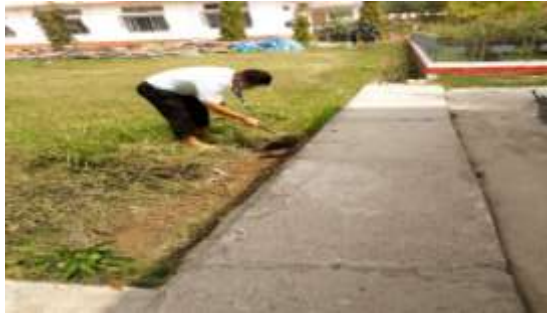
Swachhta Pakhwada 2020-21