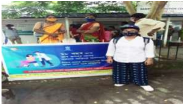
COVID 19 Awareness and Vaccination